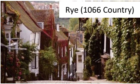
Rye (1066 Country)