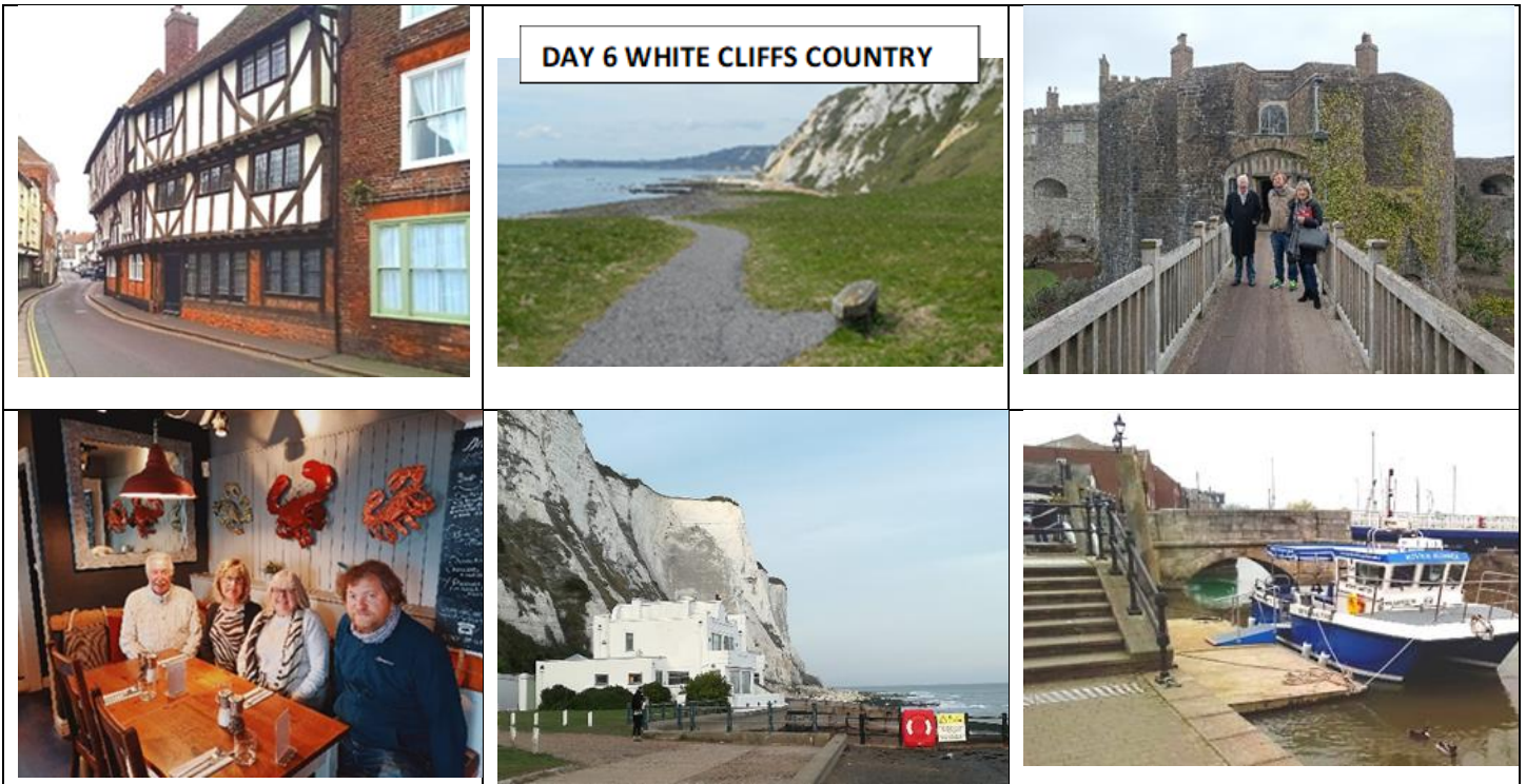
DAY 6 WHITE CLIFFS COUNTRY

Where coast meets countryside, ancient meets modern, relaxation meets adventure and England meets Europe. White Cliffs Country , in the south east of England, with its world-famous heritage coast, fascinating history, characterful towns and picturesque villages is where you will find a warm welcome, sea air and plenty of space for adventure or relaxation.