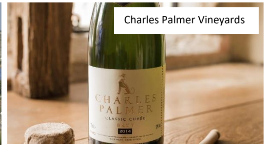
Charles Palmer Vineyards

Start your trip in 1066 Country ( www.visit1066country.com ). Set deep in history, where the Sussex Weald meets the sea, lie the ancient settlements and rich landscapes of 1066 Country. Open skies and broad horizons inspire the imagination. 1066 Country is home to some of Sussex's finest coast and countryside including the famous historic site on which the Battle of Hastings was fought. It encompasses 30 miles of coast, 22 Festivals, 15 museums, 4 galleries and 6 castles! Discover the unique towns and villages of Battle, Bexhill, Bodiam, Camber, Hastings, Herstmonceux, Pevensey, Rye and Winchelsea.