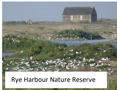
Rye Harbour Nature Reserve