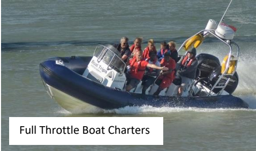
Full Throttle Boat Charters