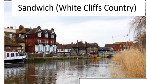
Sandwich (White Cliffs Country)